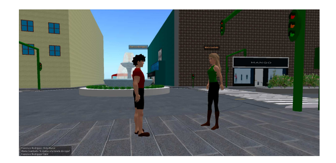
Figure 1: Two avatars maintaining a public conversation, the rest of the avatars in a radius fewer than 20 meters from them could ear their conversation.

The platform generates a large amount of different kinds of raw data. All of these data is automatically extracted and stored in several databases from each avatar connected to the VW. Data is kept using a predefined format that later can be easily exported and analysed by external statistical, or Data Mining, modules. All this information is stored by the platform in log files, so it first has to be extracted.