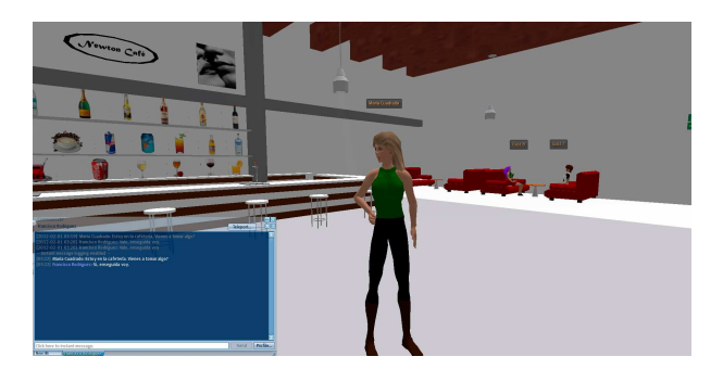
Figure 2: An avatar is sending a private message to a friend or other known avatar, the surrounding avatars cannot receive these messages.