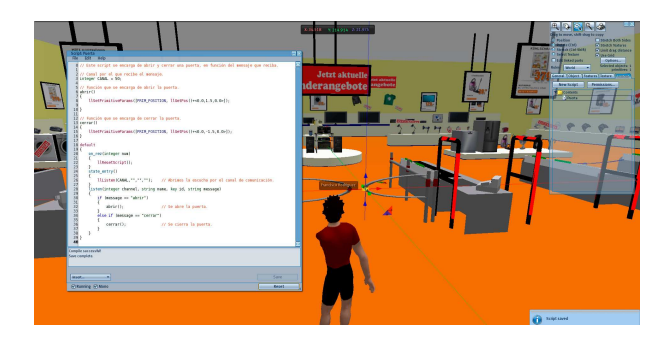
Figure 3: An avatar is programming using the Linden Scripting Language to generate some functionality in a particular object.

avatars that use the VW to learn foreign languages [5], in our case, German. There are several differences with previous (public) chat, one is related to the messages commands, now they are not necessary because the message is directly send to the owner. Finally, there exists an identification of the sender (From) and the receiver (To) using an UUID (unique identifier). An example of log containing this kind of data follows.